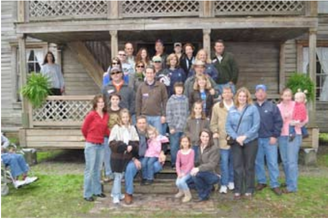
Members of Class VII with their families at the Carlton Cracker House at the Florida State Fair.