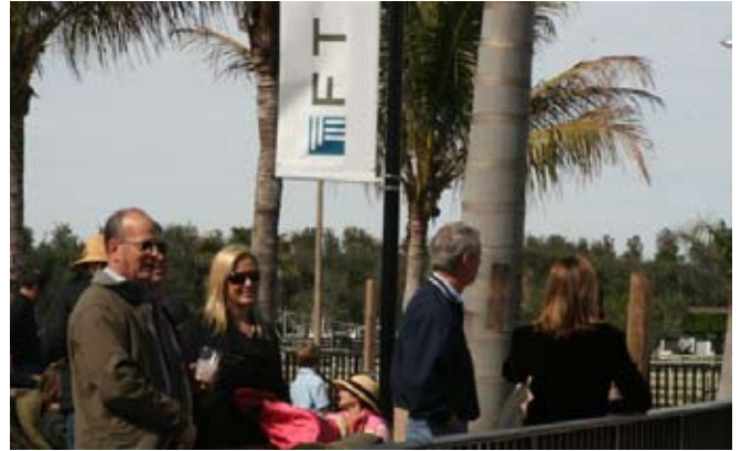
Enjoyable afternoon at the Palm Beach International Equestrian Center